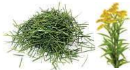
Lawn Clippings and Weeds